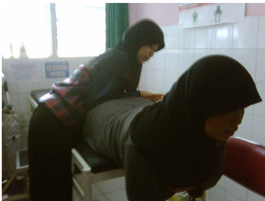
Figure 2. Erector spinae endurance testing

Erector spinae endurance was assessed by the Biering-Sorensen test, which yields a measure of static endurance of the erector spinae. The BSME test measures the elapsed time during which the participant is still capable of maintaining the unsupported upper part of the body in a horizontal position (Figure 2).